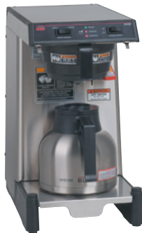
Model WAVE-S-APS with Deluxe 1.9L Thermal Carafe (thermal carafe sold separately)

Dimensions: 16.94-18.69" H x 9.71 W x 17.24"D (43cm H x 22.2cm W x 43.8cm D)