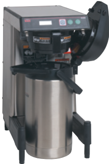
Model WAVE-APS with 2.5L lever-action Airpot (airpot sold separately)

Dimensions: 16.94-18.69" H x 9.71 W x 17.24"D (43cm H x 22.2cm W x 43.8cm D)